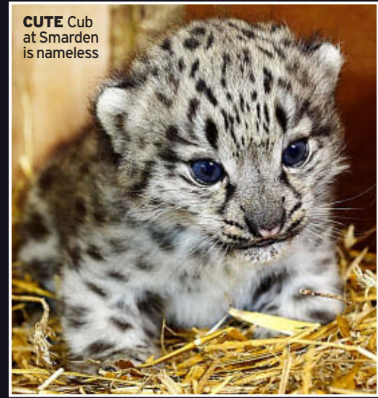
CUTE Cub at Smarden is nameless

Meanwhile, The Big Cat Sanctuary, in Smarden, Kent, is holding a competition to name the 3.9lb baby snow leopard just born there.